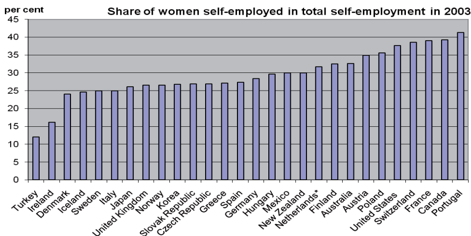
Figure 1. Share of woman self-employed in total self-employment in 2003